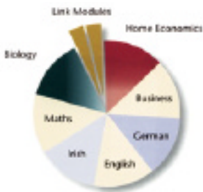
Typical LCVP Student A